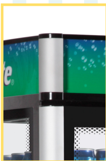
Strong aluminium corners