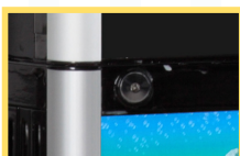
Door lock standard