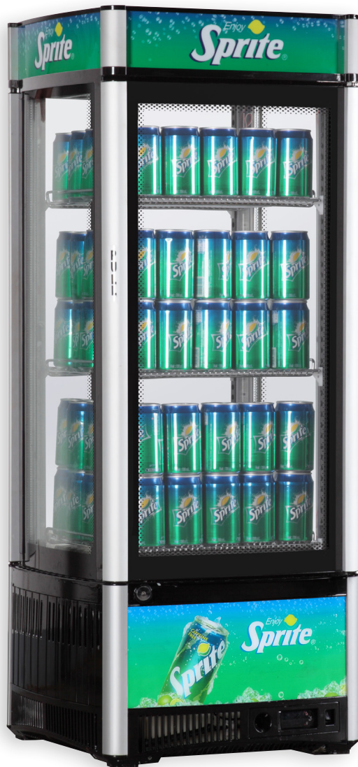
SC-112G, no canopy option

Four sided glass door chiller with robust construction and modern aesthetics