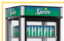
Brightly lit canopy with LED arrays