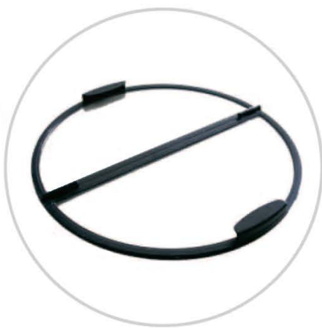
Toughened glass lid