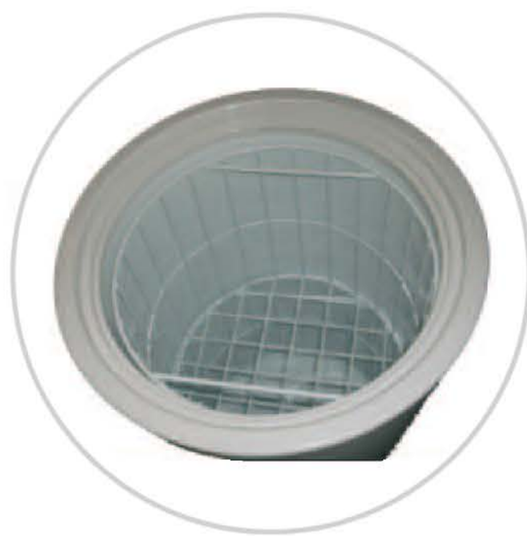
Two baskets included