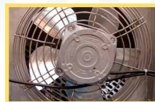
German brand EBM fan motors for reliable service