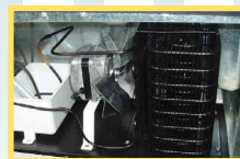
Condenser that is less prone to blocking with dust