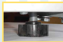
Height adjustable feet