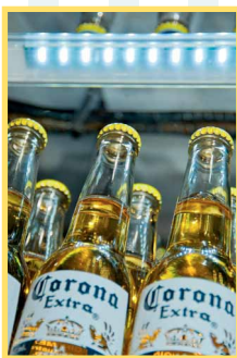
LED interior and canopy lights