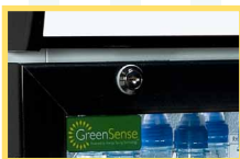
Door lock standard